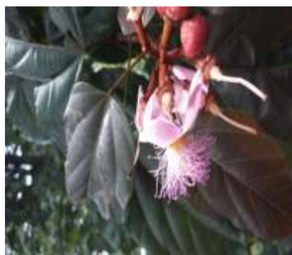
b. Pink flower, red capsule