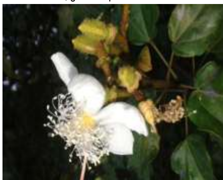
a. White flower, green capsule