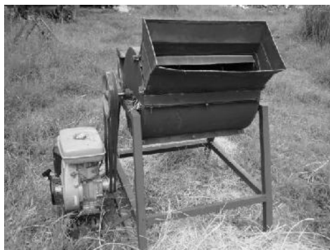
Figure 1. Developed motor driven chopper

above design aspects tangential feed type chopper (hammer mill) without blowing fan and conveyor was selected for this project. The machine utilizes the principals of hammer mill by which size reduction is accomplished by the cutting effects of rotating knives against small stationary knife plates welded in the casing. Since the knives are swinging, less danger will be occurred if hard inert material gets in to the chopper by accident. Feed enters into the chamber from top of the hopper and, chopped in to pieces by the rotating knives, will be discharged from the bottom of the machine. The knives cut the stover and other residue until it become small enough to pass through the bottom screen (Figure 1).