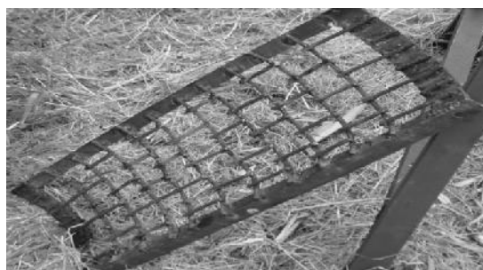
Figure 3. concave screen

The concave screen (Figure 3) was made from small bars welded on concave plates. The screen opening size is governed by the extent of the required size reduction and hence can easily be changed if required. Housing is made from 2 mm steel sheet. Machine design principles were used to determine the size of each component. Petrol engine 5HP rated power and 4000 rpm rated speed have been used for prime mover. Double grooved V belt and pulleys ( \phi 90 and \phi 250 mm) were used for power transmission.