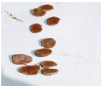
Figure 2. Effective nodules

Nodule was formed in all inoculated plots (fertilized and unfertilized). The maximum nodule number was recorded by 46 kg N + 46 kg P 2 O 5 + TAL 379 (71.5) and TAL 379 alone (69) followed by 23 kg N + 46 kg P 2 O 5 + TAL 379 (67.5) and 23 kg N ha -1 + TAL 379 (66.83) (Table 3). However, effective nodules were observed in the plots inoculated by the strain alone (without N fertilizer) and the strain with P fertilizer alone (Fig. 2). The nodules in plots with N fertilizer were light green to light pink in color. The size of the nodules from the plots inoculated with the strain alone was as large as the well matured field pea seed and pinkish in color when dissected whereas the size of most nodules of the other plots with N fertilizer are small and green to light pink in color. The less effectiveness of the nodules in inoculated plots with N fertilizer may be due to the preference of the crop to the applied N fertilizer than soothing the strain for symbiotic association to fix atmospheric N.