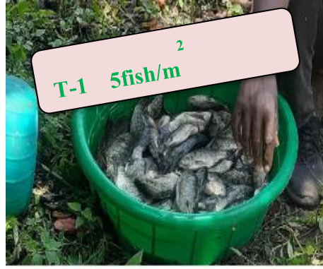
T-1 2 5fish/m