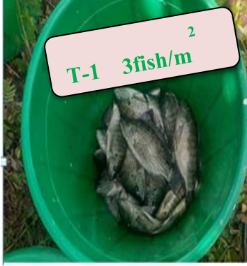
T-1 2 3fish/m