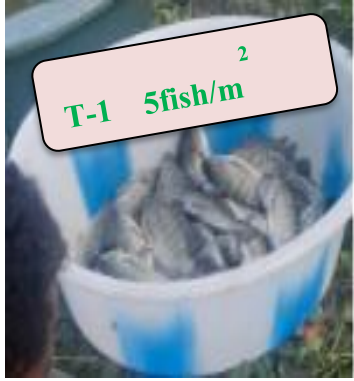
T-1 2 5fish/m