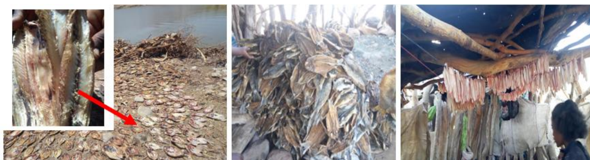
Figure 3: Plate showing traditional methods of fish drying [cyprinidae family (left and middle) and cichlidae family (right)]

Note: The values of scales are in percentage; and the number is (Cronbach's alpha reliability analysis carried out for internal consistency among Likert scale items. The reliability coefficient normally ranges between 0 and 1, while a high value for Cronbach's alpha indicates good internal consistency of the items in the scale (Gliem and Gliem 2003). The acceptable values of alpha coefficient are in the range of 0.7 to 0.95, but the maximum alpha value of 0.90 has the best. If alpha coefficient is closer to 1.00, as the result gets greater internal consistency of the items in the scale and alpha coefficients above 0.70 are considered acceptable (Tavakol and Dennick 2011; Taherdoost 2016)). Fisher's perception on all levels of agreement in (Table 5, 6, 7 and 8) was reliable and consistent. Each statistical table showed that the coefficient of alpha, \alpha > 0.7 which illustrates the perception test from all categories (items) were consistent and reliable. The statistics table gives coefficient of alpha; in this case, \alpha = 0.78 , which illustrates that the information generated were consistent and reliable.