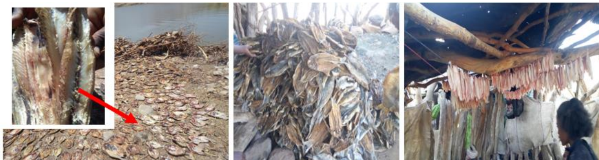
Figure 3: Plate showing traditional methods of fish drying [cyprinidae family (left and middle) and cichlidae family (right)]

Fisher's perception on all levels of agreement in (Table 5, 6, 7 and 8) was reliable and consistent. Each statistical table showed that the coefficient of alpha, \alpha > 0.7 which illustrates the perception test from all categories (items) were consistent and reliable. The statistics table gives coefficient of alpha; in this case, \alpha = 0.78 , which illustrates that the information generated were consistent and reliable.