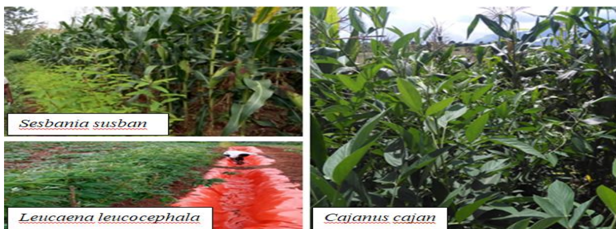
Figure 2. Trial photo in field

intercepted part of the sediment particles. A study in South-western Nigeria indicated that Leucaena hedgerows on a tropical alfisol were very effective and reduced water runoff in a maize crop to 3% and erosion to 0.10 t ha -1 (Lal 1989). Another five-year study in Philippines showed that contour hedgerows of Gliricidia and Paspalum conjugatum (GPas) reduced soil loss by 67% at the Compact site and by 77% at the Cabacungan site (Agus 1999). Another study conducted in China by Sun discussed the effect of alley cropping on controlling soil erosion (Xu et al 1999), Cai analyzed the mechanism of alley cropping controlling soil erosion and held that mechanical interception could be the main reason for reducing soil loss by alley cropping (Sun H. et al 1999). Also, this bio-terrace considerably reduced soil nutrient loss and increased organic matter, facilitating N, P, and other nutrients moving toward the root zone (Cai et al 1998). According to most of the studies conducted in southwestern China, alley cropping has been proven to have great potential in both economic and environmental advancement (Sun et al 1999a, 1999b; Zhang 2001; Zhu and Chen 2006).